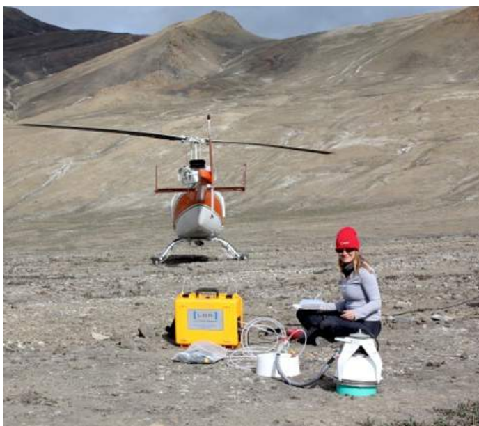
More photos showing the UGGA in operation above the Arctic Circle (on Axel Heiberg Island (Axel Heiberg Island is an island in the Qikiqtaaluk Region, Nunavut, Canada. Located in the Arctic Ocean, it is the 31 st largest island in the world and Canada's seventh largest island. According to Statistics Canada, it has an area of 43,178 km 2 .