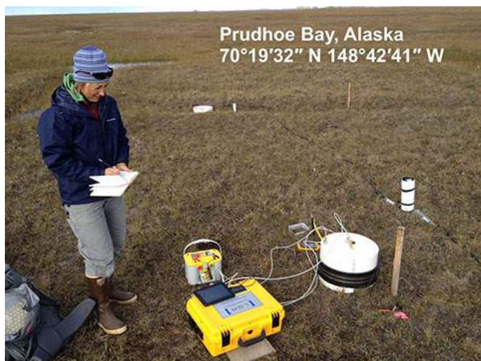
Ultraportable Greenhouse Gas Analyzer provides continuous measurements of CH 4 , CO 2 and H 2 O in soil chambers at Prudhoe Bay, Alaska, 70°19'32" N 148°42'41" W using only battery power