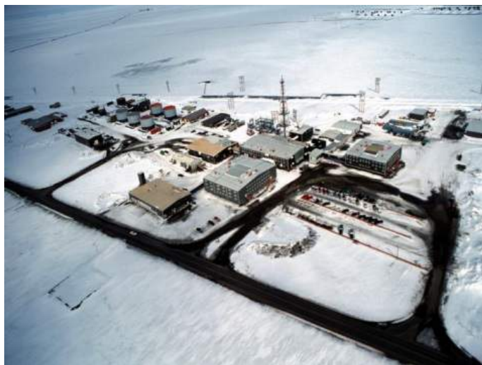
Prudhoe Bay oil field

The Prudhoe Bay field is the largest field in North America and the 18th largest field ever discovered worldwide. Of the 25 billion barrels of original oil in place, more than 13 billion barrels can be recovered with current technology.