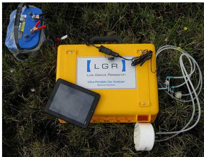
LGR's Ultraportable Greenhouse Gas Analyzer records methane, carbon dioxide and water vapor in real time in soil collars/chambers above the Arctic Circle (71° 15' N, 156° 37' W)